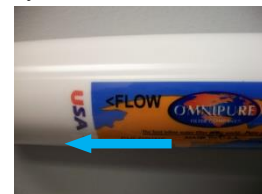
B: Presses a tube lock, pull out the mains

Finally, remember to revert step 1 to 2, system will resume normal after 2-3 hours.