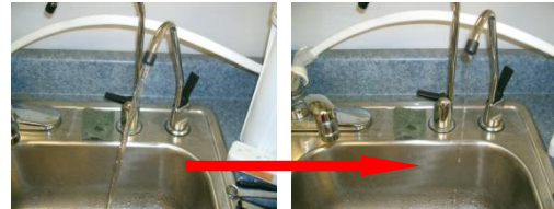
B : Open drinking water faucet